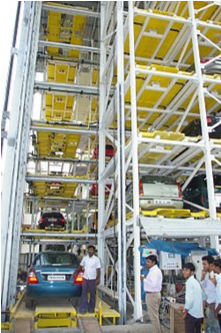
A Semi-Automated Parking System