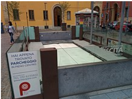
Entrance of an underground automated parking system in historic center of Bologna , Italy.