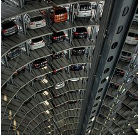
A large fully-automated parking system